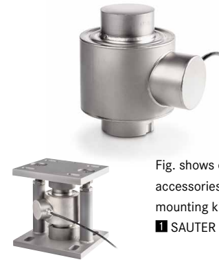
Fig. shows optional accessories, mounting kit ■ SAUTER CE P4136